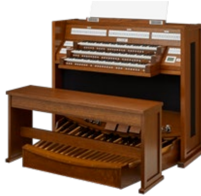
L I V E 3 T - A