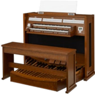
L I V E 2 T - A